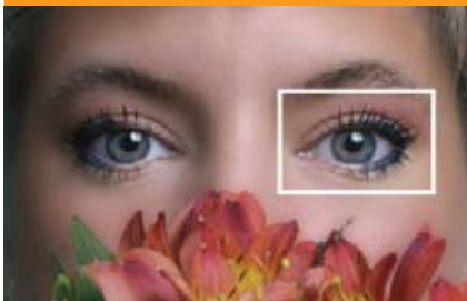
Fixed Dot Printing